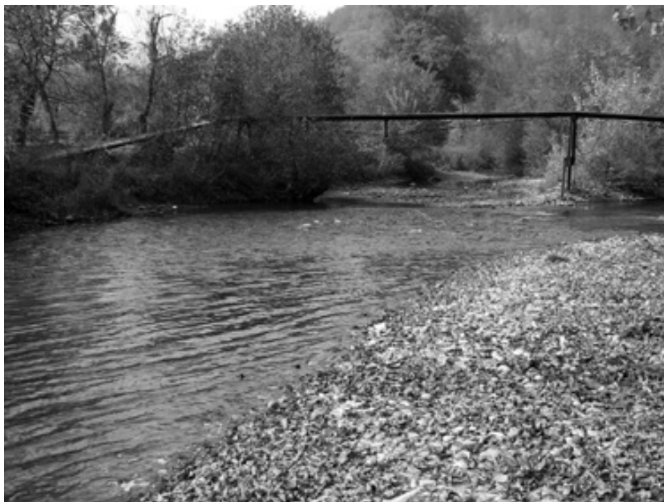
Figure 3: Locality Ušće at Studenica Stream – a sampling site with typical habitats of Pomatinus substriatus (Müller, 1806)

parameters also reflect high or good water status (class I or II). A review of measured physical and physico-chemical parameters at localities where Pomatinus larvae were registered are shown in Table 1.