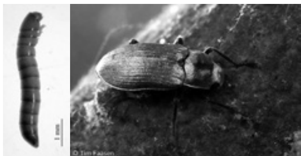
Figure 1: Pomatinus substriatus (Müller, 1806): a-larva, b-adult

tergites, from the mesothorax to the 9th urit, there are deep grooves separated by small dark sclerotised cerci. Dryops larvae are differentiated from Pomatinus larvae by the lack of hooks and grooves on the oral edge of tergites (Ibidem). The Pomatinus adult (Fig. 1b) is easily distinguished from Dryops by the general form and the recumbent covering of hair (Foster, 2010), has a pronotum without furrows (although a narrow rim is present), short hair and a size of 4.5-5.5 mm (Friday, 1988).